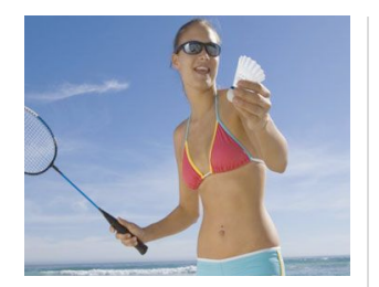
10 Tips for guaranteed weight